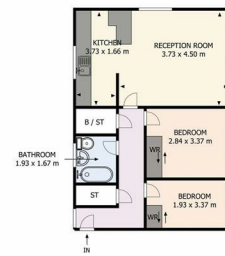
Woodfall Drive, Crayford, DA1 4TN

This plan serves solely as a layout guide, and no liability is assumed for errors, omissions, or inaccuracies. It was developed in accordance with the RICS Code of Measuring Practice. All dimensions, including windows, doors, and the total gross internal area (GIA), are approximate and measured internally. All measurements have been taken at the widest points unless otherwise stated. The first measurement provided refers to the vertical wall. For accurate measurement please consult a certified architect or surveyor prior to making any decisions based on this plan.